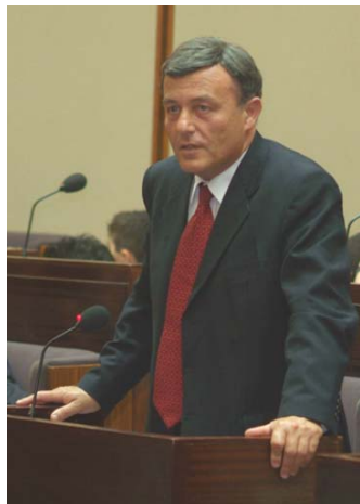
The Hon. Dr Alfted Sant, Leader of the Opposition

The Hon. Dr Alfted Sant, leader of the Opposition, proposed an annual repeat of the EkoSkola parliamentary session in which the children, rather than the MPs, are the real protagonists. He pointed out that the honest feedback that children provide could be the basis of concrete proposals to promote environmental education that could be tabled for approval by the parliament.