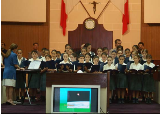
School choir singing “la Preghiera”

As a token of remembrance of this session, all students were invited to take a group photo with the MPs. Furthermore; each participating school will be given a printed version of the motion together with a singed commitment for its implementation by the MPs who participated in the debate.