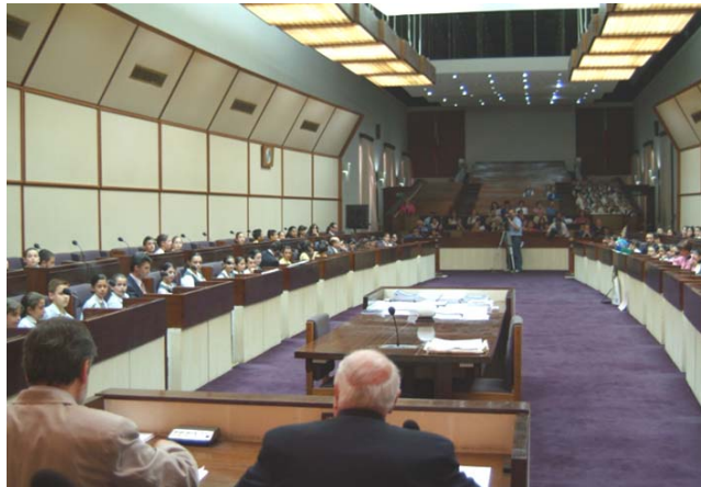
General view of the EkoSkola Parliamentary session

“Parliament should have more sessions like this one. For once I attentively listened through everything that was being presented during the debate.”