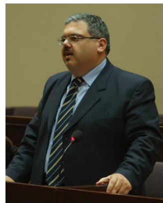
The Hon. George Pullicino, Minister for Rural Affairs and the Environment

The Hon. George Pullicino, Minister for Rural Affairs and the Environment, remarked on the change in culture that this programme is generating in schools: a move towards more sustainable lifestyles. He pointed out that although legislation is important in a nation's effort to safeguard the environment, environmental education is a more long-term and radical solution that needs to be placed at the forefront of our nation's educational priorities. He therefore invited his colleagues to approve the motion being tabled and to pledge full support to it.