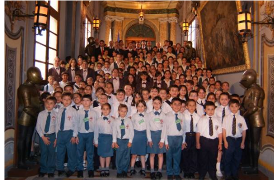
Group photo: all the children attending the event with the MPs