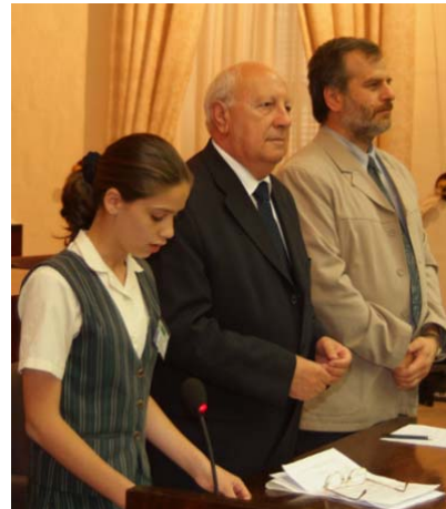
Reading of the introductory prayer

He welcomed the students whom he praised for their "strong sense of citizenship" and their "genuine commitment to do something positive for the environment, rather than complaining about what others should do". In his concluding comments he stressed the need to invest in this programme by pointing out that "if these citizens are already fully committed to the improvement of their environment, imagine the greater contribution that they will offer their country in the future".