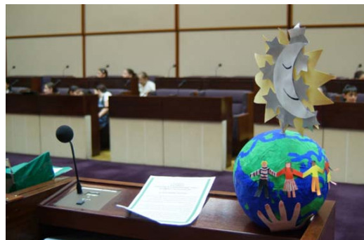
And the commitment continues ...