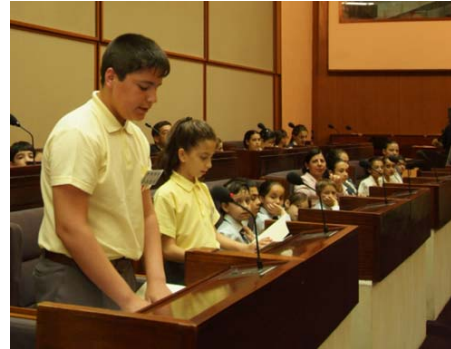
Students reading the Motion about EkoSkola presented to the House of Representatives

From what has been achieved till now, it is quite clear that EkoSkola is helping in the holistic development of our schools. Moreover, EkoSkola is helping us collaborate more with our Local Councils for the benefit of our localities. EkoSkola is becoming more and more popular and it will not be long till certain schools receive the Green Flag, which is a world-renowned certificate testifying that the school that received it is seriously committed for the care of the environment.