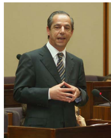
The Prime Minister, the Hon. Dr Lawrence Gonzi

After the last intervention, the Hon. Speaker moved for the approval of the motion. The motion was unanimously approved by the parliament and the session was closed with the singing of the song "la Pghiera".