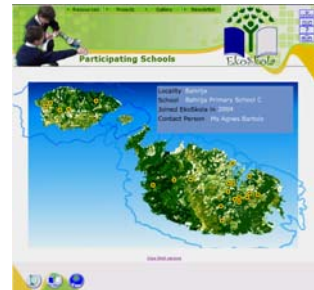
Participating Schools page

We would like to take the opportunity to encourage our member schools to contribute to the Projects Page by sending in write ups of activities related to EkoSkola that they organise from time to time.