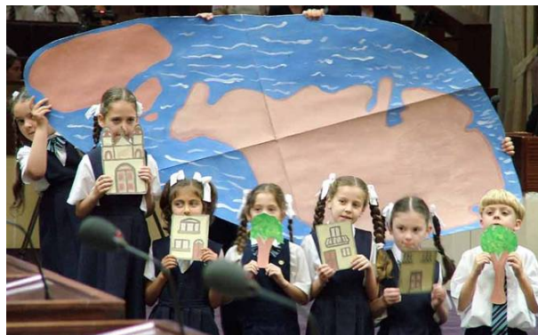
Malta's future ... our future

So we would like you to support our efforts for a better Malta by giving us your word that you will keep the present and future welfare of our environment in mind in every decision taken in this House. This will ensure that we will have a good quality environment that we can enjoy and live safely in.