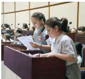
Children making their presentation

In his reply the Hon. Evarist Bartolo, Opposition spokesperson for Tourism, recalled his childhood days and pointed out that although, back then, they lacked all the gadgets that we have today that make our life more comfortable, they enjoyed more open spaces and less pollution. In hindsight, most of the choices we made have reduced our quality of life because they did not respect the environment. We need to ensure that we do not repeat the same mistakes in the decisions that we will have to take in the future.