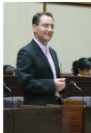
Opposition spokesperson for the Environment, Hon. Roderick Galdes

The Hon. George Pullicino, Minister for Rural Affairs and the Environment, heartily thanked the children participating in EkoSkola for their commitment. He recalled the emotional moment when he saw the look of satisfaction on the children’s faces during the official Green Flag hoisting ceremonies. He considers the Green Flag an invitation for environmental