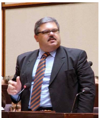
Hon George Pullicino, Minister for Rural Affairs and the Environment

responsibility. He then quoted data collected by his office that showed that during this scholastic year 2,000kg of paper, 400kg of plastic and 70kg of batteries have been collected from schools for recycling. He finished his address by pointing out that the fact that children are doing their bit, should encourage MPs to do the same.