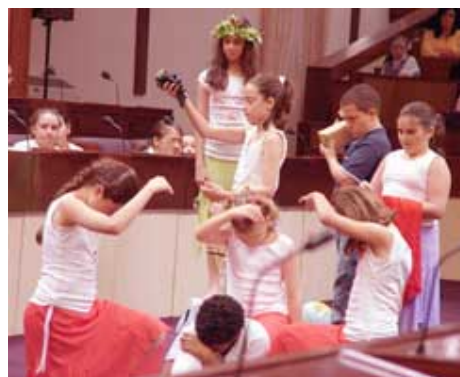
One of the performances staged by the children for the parliamentary session

After the last intervention, the Hon. Deputy Speaker moved for the approval of the motion. The motion was unanimously approved by the parliament and the session was closed with the singing of the song by the choir of the Primary School C - Mqabba.