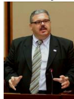
Hon. George Pullicino: Minister for Rural Affairs & the Environment

After some additional comments by students from other schools, the Hon. George Pullicino, Minister for Rural Affairs & the Environment, pointed out how much he appreciates that the EkoSkola students are doers not just talkers. He reminded the House of the various spontaneous initiatives that school children took to counter the vandal act on the trees in Mellieha. "With the passing of time, Maltese children a becoming an environmental force to reckon with ... particularly for us adults when we cannot justify our unsustainable actions with them." The minister also praised the call for EkoSkola teachers who will be supporting the programme during the next scholastic year.