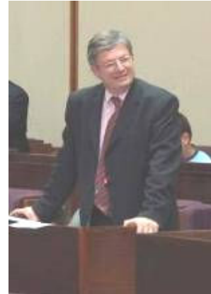
Hon. Dr Tonio Borg: Deputy Prime Minister

The Hon. Dr Tonio Borg, Deputy Prime Minister, commented that a popular book had said that 'flowers don't grow in the parliament'. He added that today this saying was proved wrong. He invited his fellow MPs to learn from the enthusiasm and honesty of the EkoSkola children. "These children are presenting us with an open invitation for us to actively work towards a good quality of life in schools and communities for our benefit and that of others" .