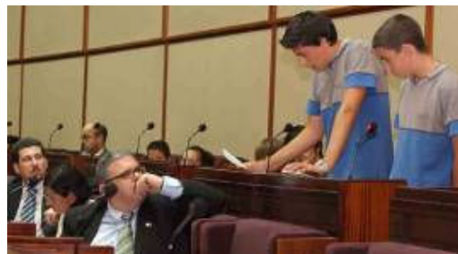
School children presenting their research data and suggestions to the MPs