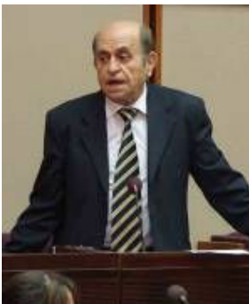
Hon. Dr Joe Brincat: Opposition spokesperson for the Environment & National Heritage

more often. Children are an underused resource because they are taken for granted. The environment is silent ... it's voice are the children. EkoSkola is allowing children to voice their concerns.