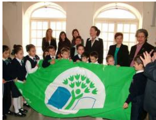
Children from Zurrieq Primary A proudly holding the Green Flag.