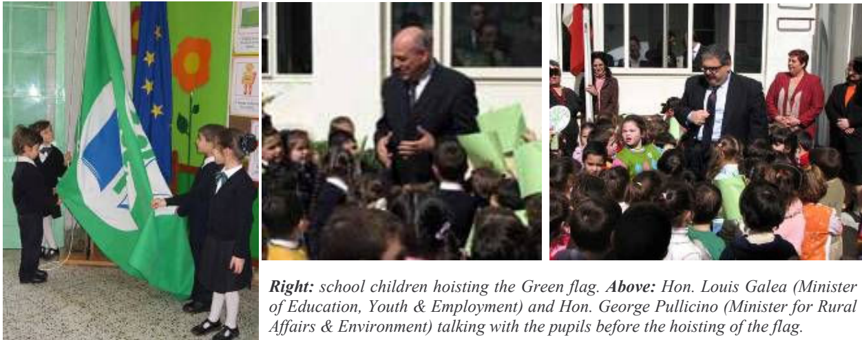
Right: school children hoisting the Green flag. Above: Hon. Louis Galea (Minister of Education, Youth & Employment) and Hon. George Pullicino (Minister for Rural Affairs & Environment) talking with the pupils before the hoisting of the flag.

addressed by the EkoSkola Committee who explained what the school went through to deserve the Green Flag, the guests were also addressed by the Minister for Rural Affairs & Environment, Hon. George Pullicino, and the Minister of Education, Youth & Employment, Hon. Louis Galea who focused on the benefits that the EkoSkola programme is providing to Maltese schools.