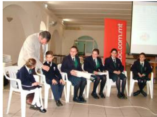
School children from the Green Flag schools explaining EkoSkola's seven-steps during the seminar