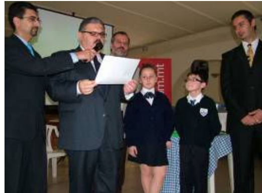
Children from Zurrieq Primary B receiving the Silver Award